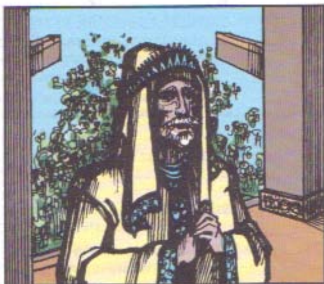
Solomon dedicated the Temple in prayer.

After Solomon concluded his prayer, he turned to the people with words of blessing. He expressed to them God's purpose for Israel (First Kings 8:60): "That all the people of the earth may know that the Lord is God, and that there is none else."