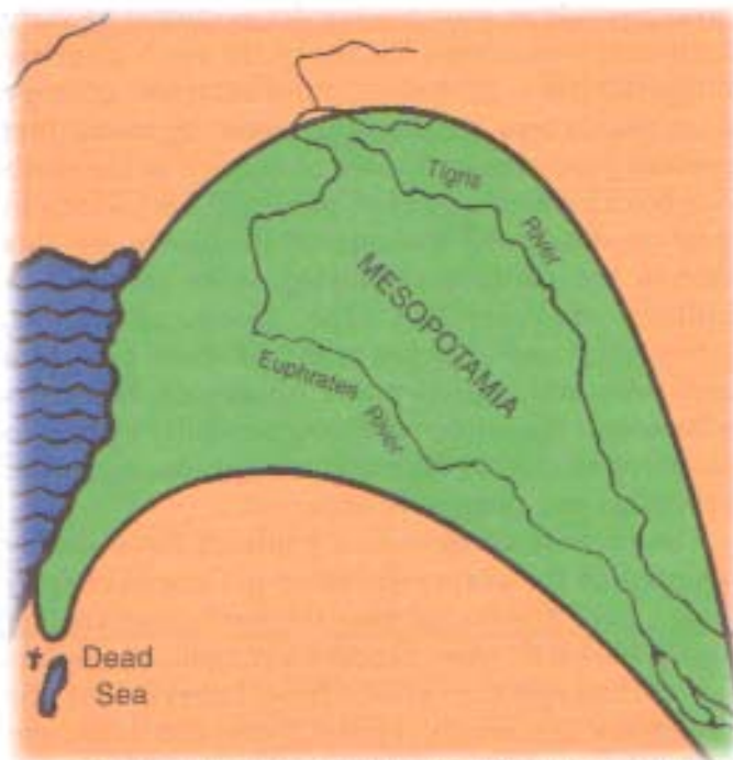
Mesopotamia and the Fertile Crescent

Historians believe that the inhabitants of this area came from the mountains east of the Tigris. Bible believers would agree that, in fact, they came from Ararat. Around 3,000 B.C. cities first arose in Sumer. Those cities were built by Nimrod, called the "mighty hunter." They were called Babel, Erech, Accad (hence the Akkadian language), and Calneh. Sumer was the location of biblical Shinar. Among archaeological findings in these areas are ziggurats, or temple towers. These ziggurats are reminiscent of the biblical Tower of Babel.